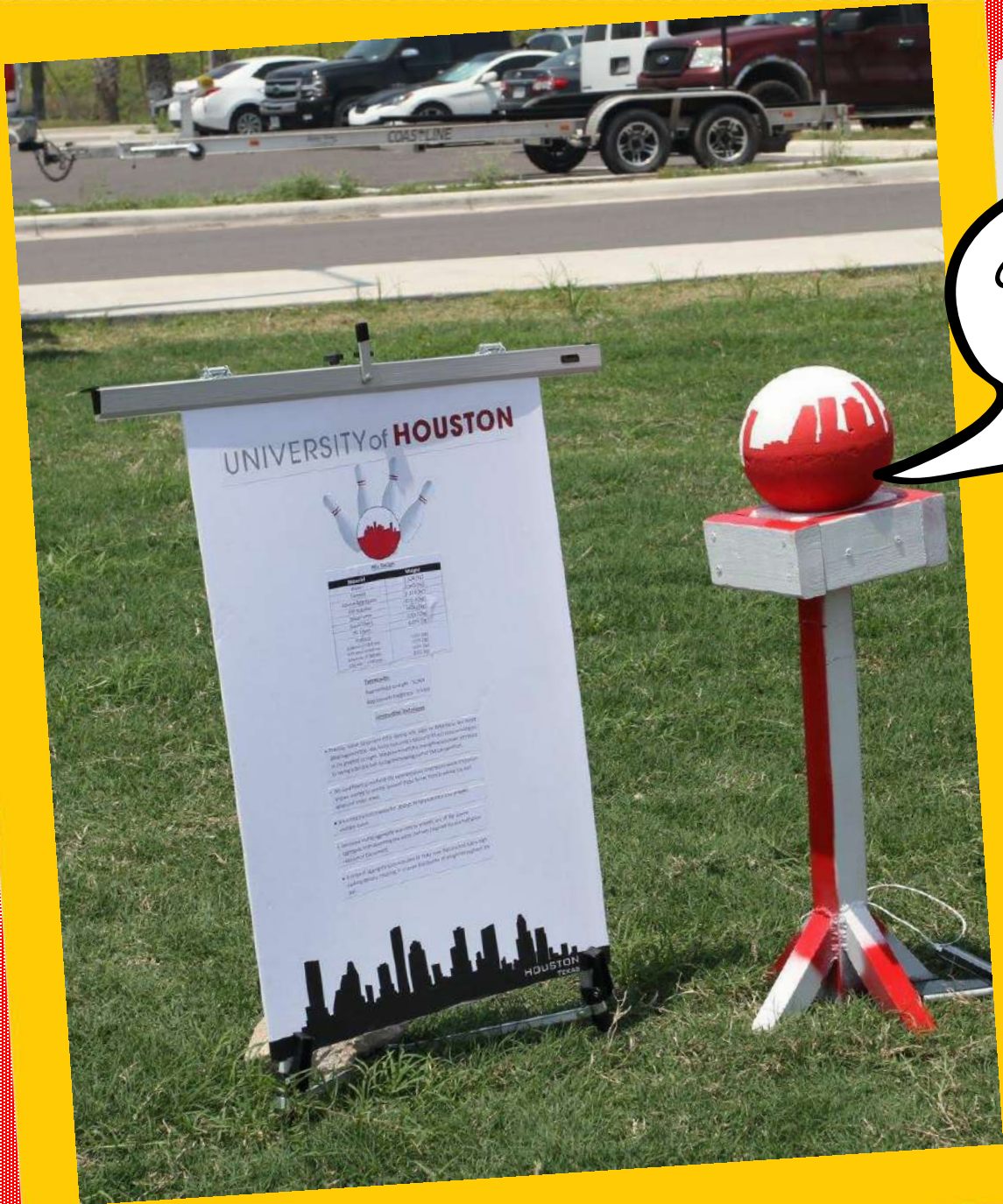
Concrete Bowling Ball