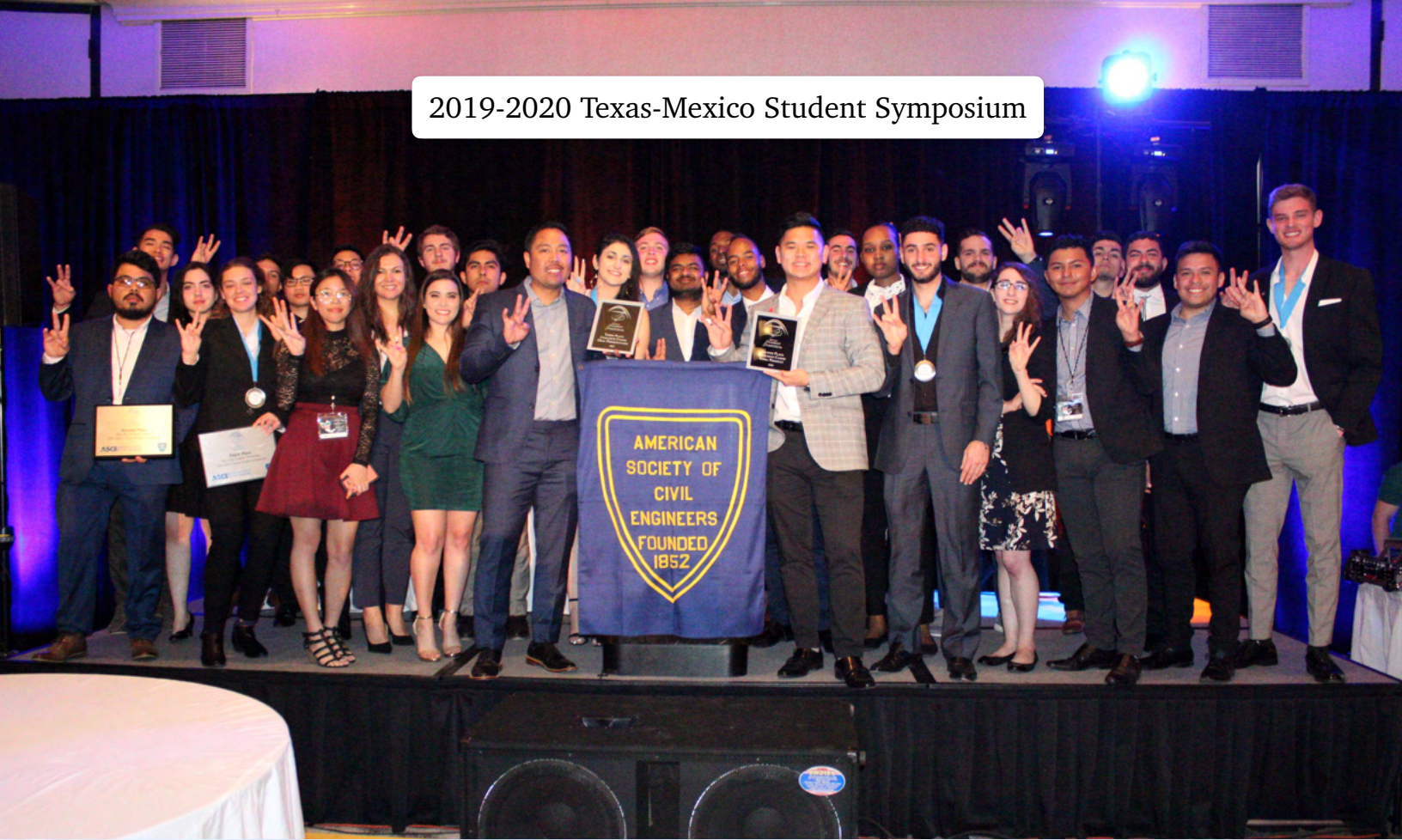
2019-2020 Texas-Mexico Student Symposium Concrete Canoe